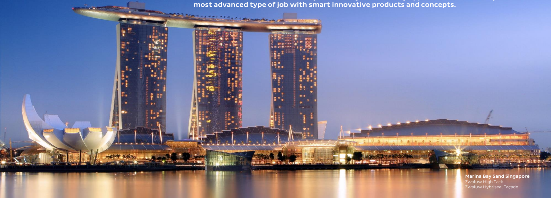
Marina Bay Sands Singapore Zwaluw High Tack Zwaluw Hybriseal Façade

For the professional workers in the construction and façade industry Bostik is offering a wide portfolio to fulfill all needs and requirements at levels of innovation, technology, certifications and costs efficiency for sealing and bonding applications all the way till the most advanced type of job with smart innovative products and concepts.