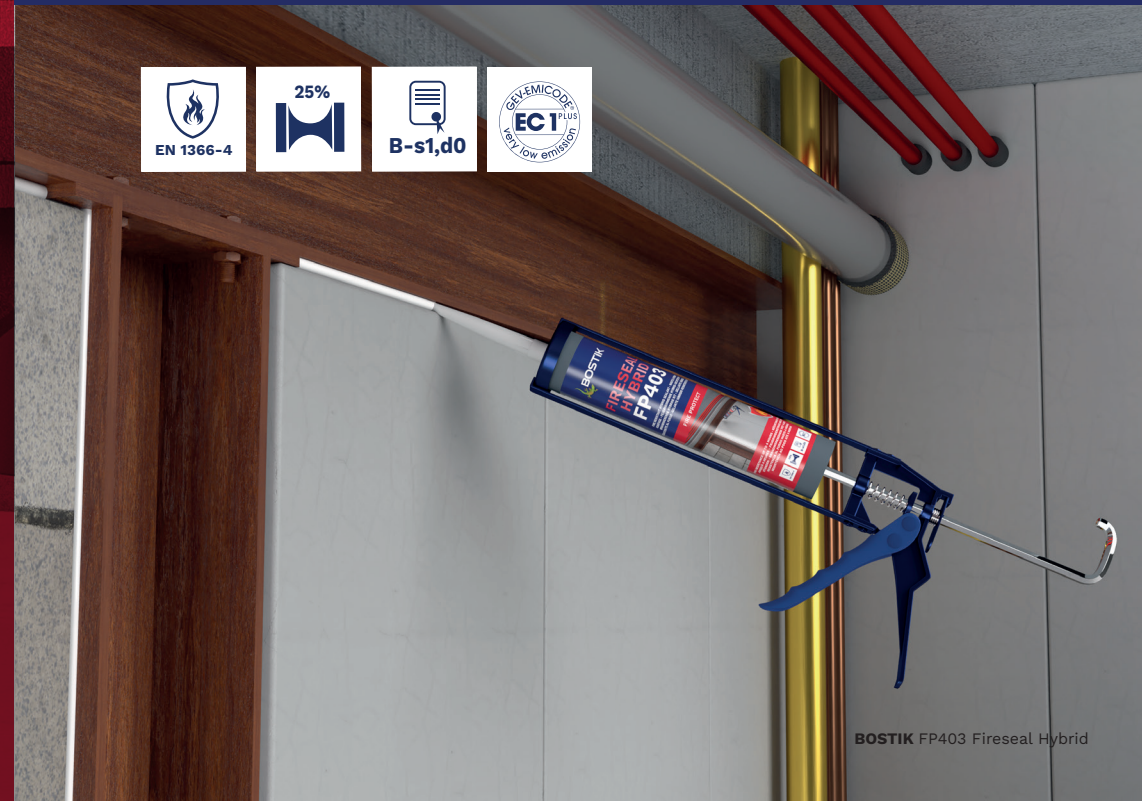
BOSTIK FP403 Fireseal Hybrid