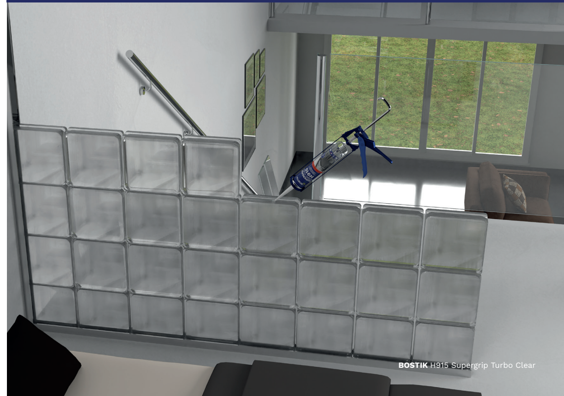
BOSTIK H915 Supergrip Turbo Clear