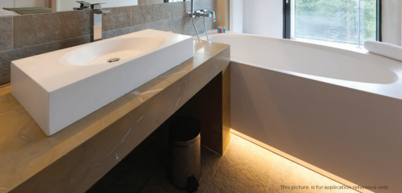
This picture is for application reference only