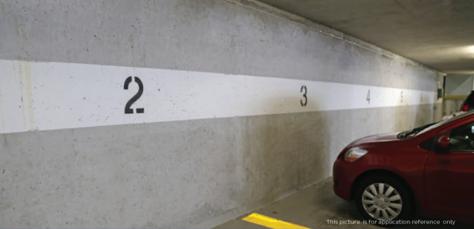
This picture is for application reference only