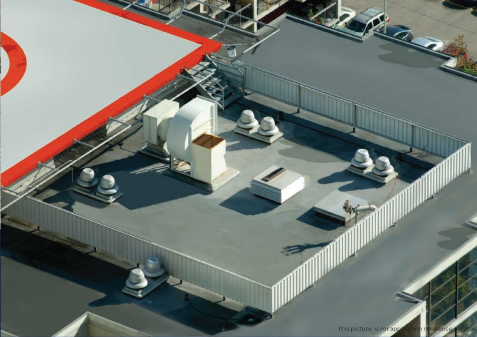
This picture is for application reference only.