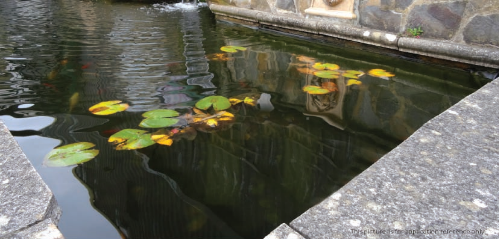
This picture is for application reference only