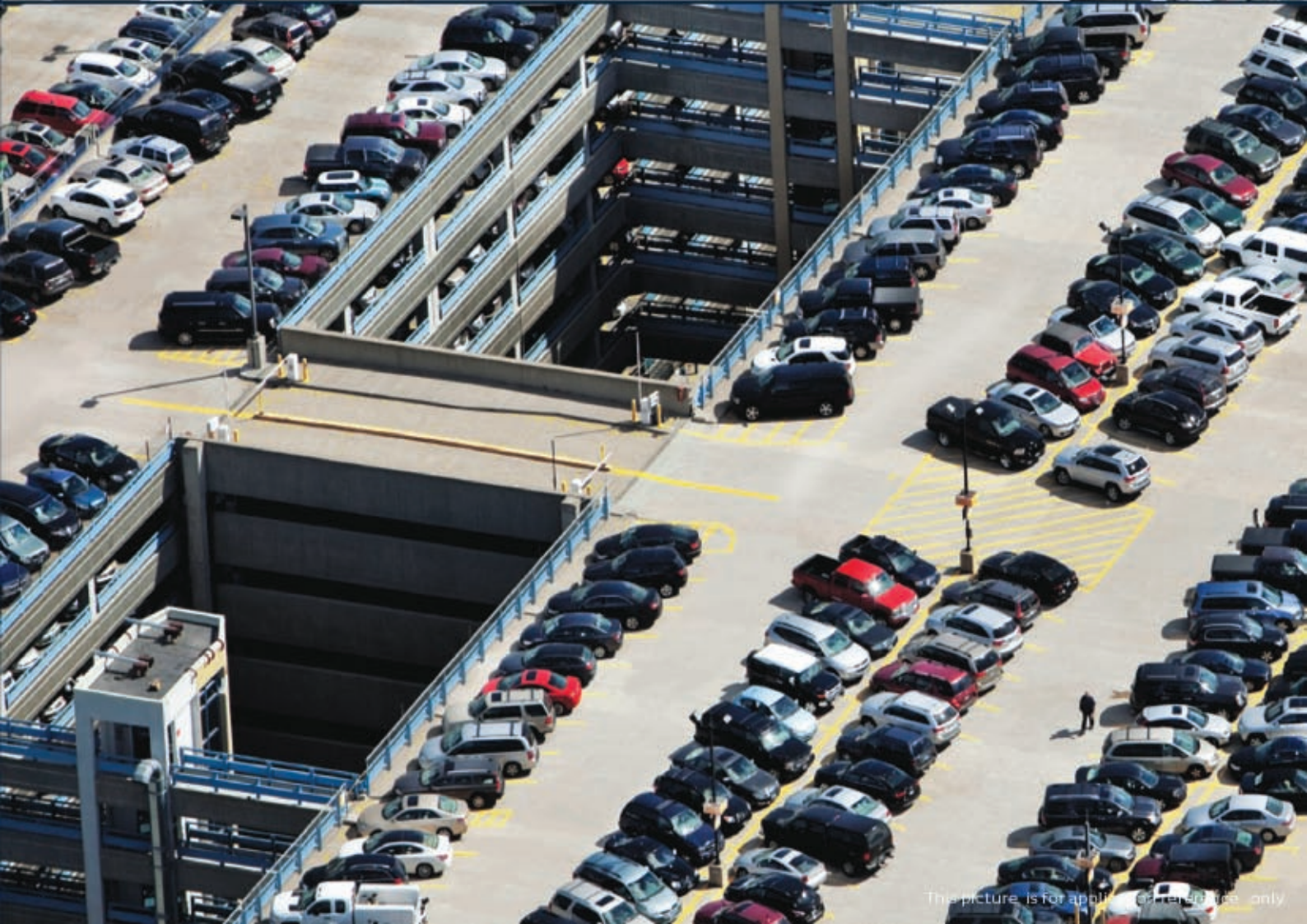
This picture is for application reference only.