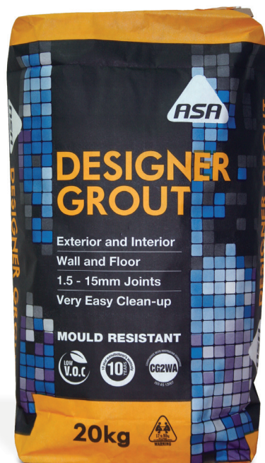
ASA DESIGNER GROUT