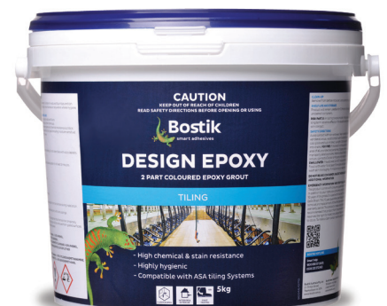
DESIGN EPOXY GROUT