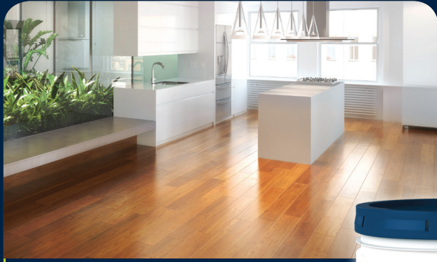
RESIDENTIAL SINGLE STOREY