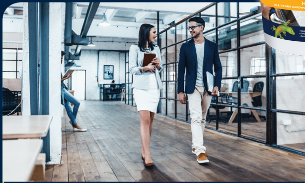
COMMERCIAL SINGLE STOREY