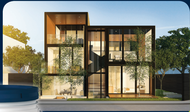
RESIDENTIAL MULTI STOREY