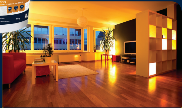
COMMERCIAL MULTI STOREY