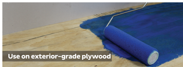
Use on exterior-grade plywood