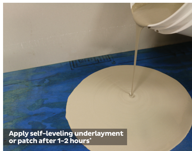
Apply self-leveling underlayment or patch after 1-2 hours*

*Note: Temperature and humidity will effect drying time of SL-Primer™