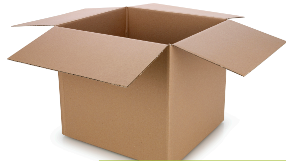
CASE AND CARTON SEAL

The Safety Data Sheet should be consulted for proper handling, clean up and spill containment before use. Keep containers covered to minimize contamination.