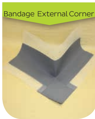
Bandage External Corner