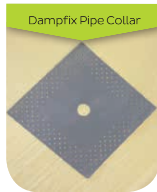
Dampfix Pipe Collar